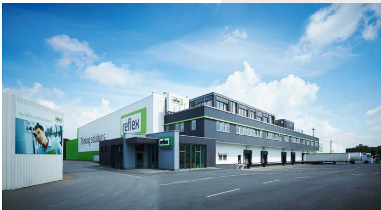
Headquarters of Reflex Winkelmann GmbH in Ahlen, North Rhine-Westphalia