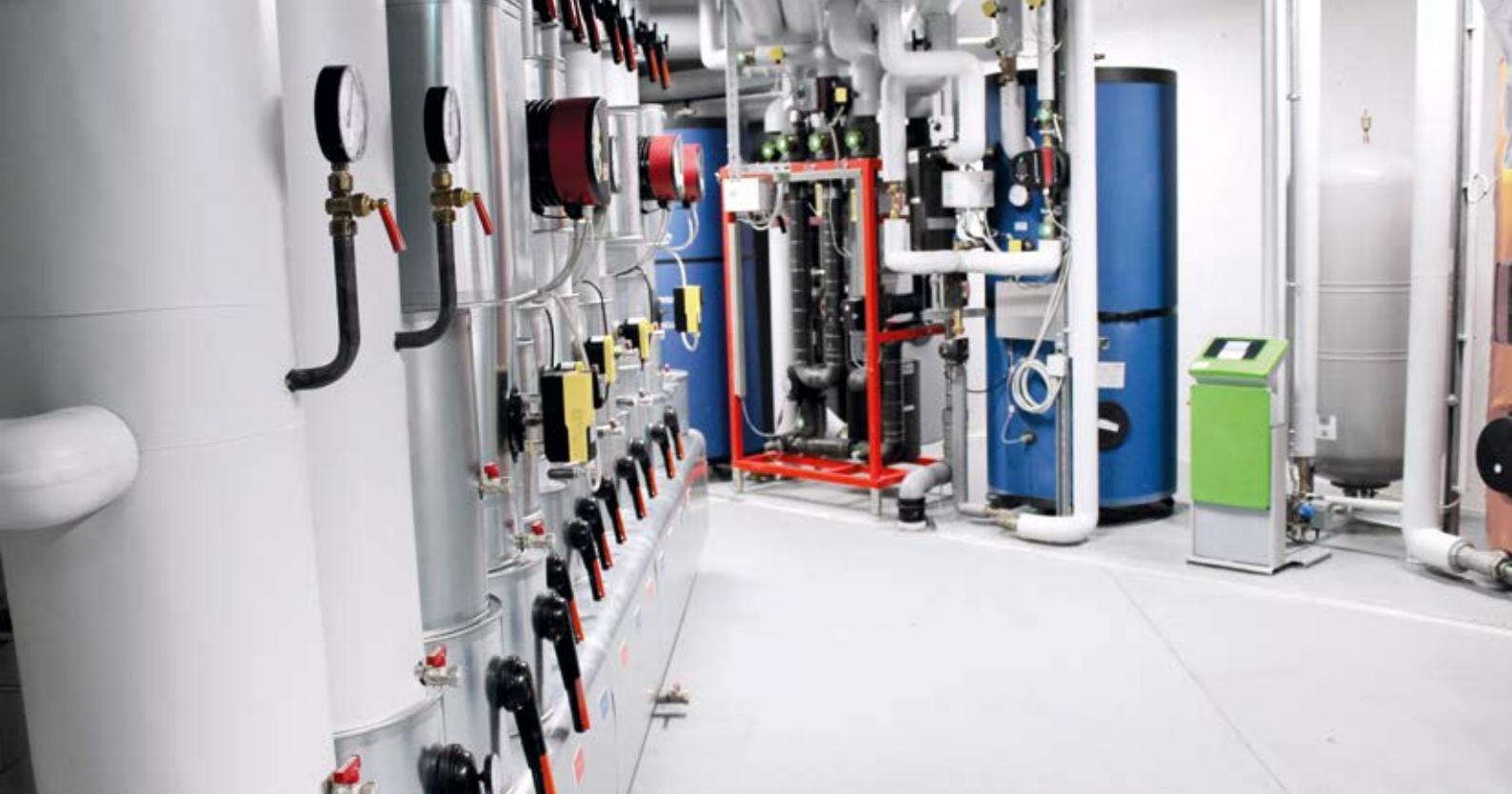
Reflex and Sinus at Novotel Centre Ville, Nuremberg