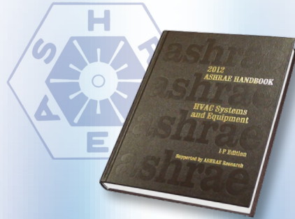
ASHRAE 2012 HVAC Handbook, Chapter 17, "Ultraviolet Air & Surface Treatment"

UV light technology has been recognized for its benefits and energy savings in the following industry and government handbooks: