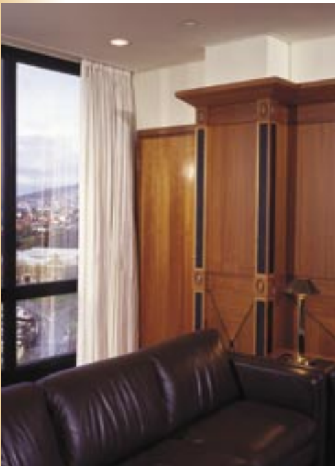
NAP timber acoustic doors installed in an executive office.

Double doors are used where wider than normal access is required, whilst still achieving excellent noise reductions, e.g. Theatres, Hospital Passageways, Operating Theatres, Machine Rooms, etc.