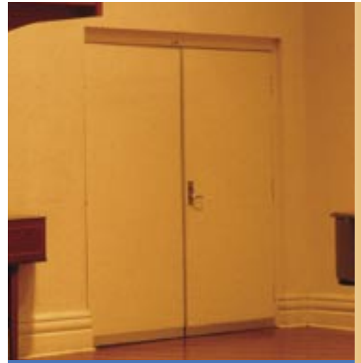
A typical NAP double leaf door supplied to a Music Conservatorium.

Please note that extended backsets and cylinders for locks will be required for most NAP doors.