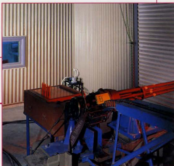
Acoustic Wall Lining, 29mm Proof Facility, Graytown, Victoria

Under normal circumstances, except for wear and tear, the profile is maintenance free.