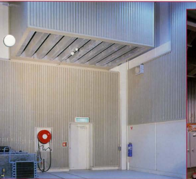
Left: Acoustic ceiling lining, City of South Melbourne workshop Above: Generator Room, Acoustic wall lining Right: Building Plant Room, Melbourne