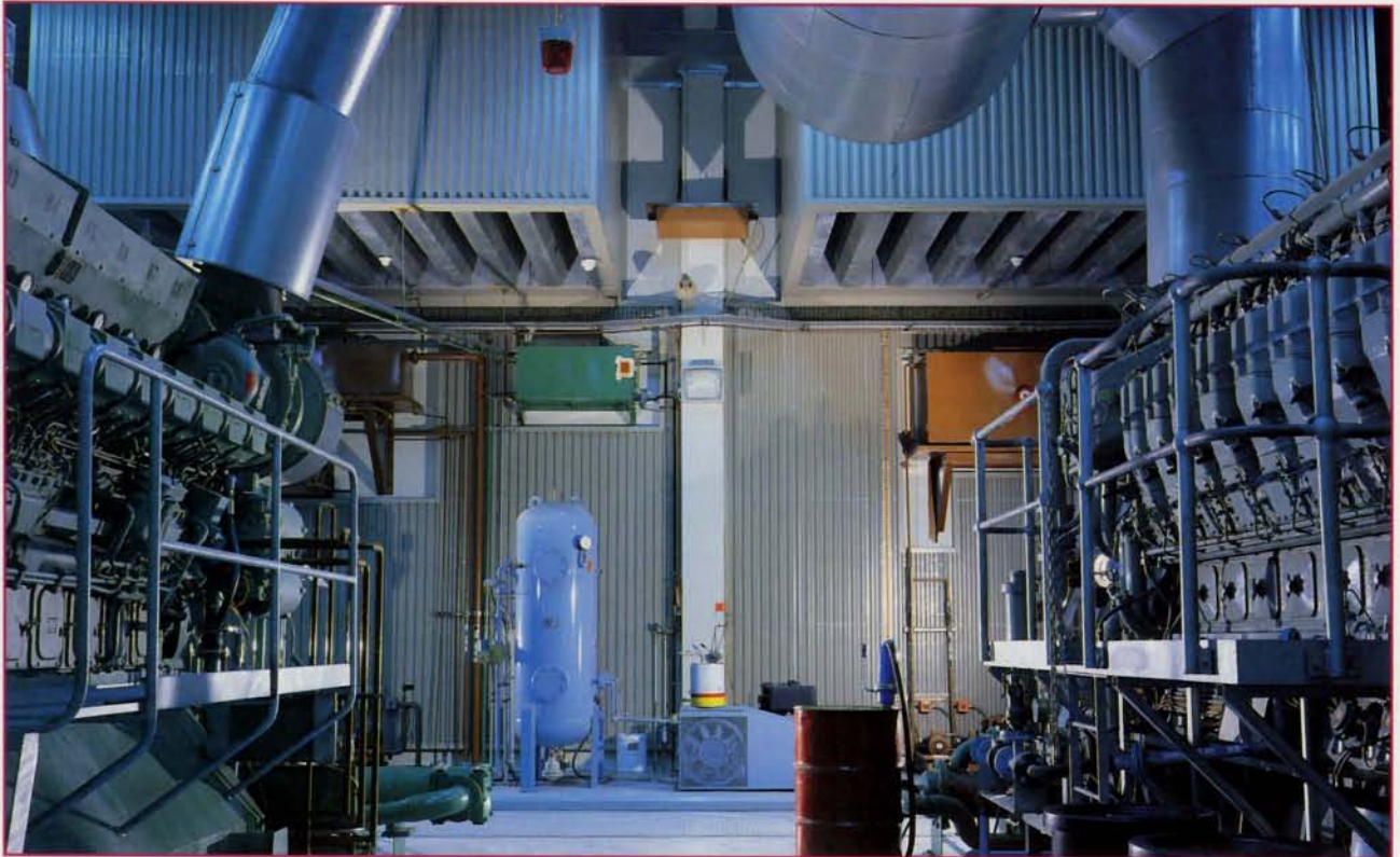
Typical Generator Room Acoustic wall lining.

N AP 'Soundwave' acoustic lining to be supplied by NAP Silentflo.