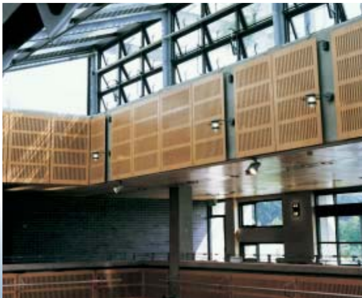
Photographs show NAP "Ambience" Panels as installed at Macquarie University in Sydney.

"The high tech solution to reverberation control"