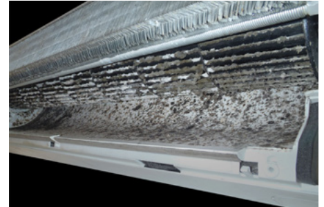
Mold thrives on mini-split blower wheels