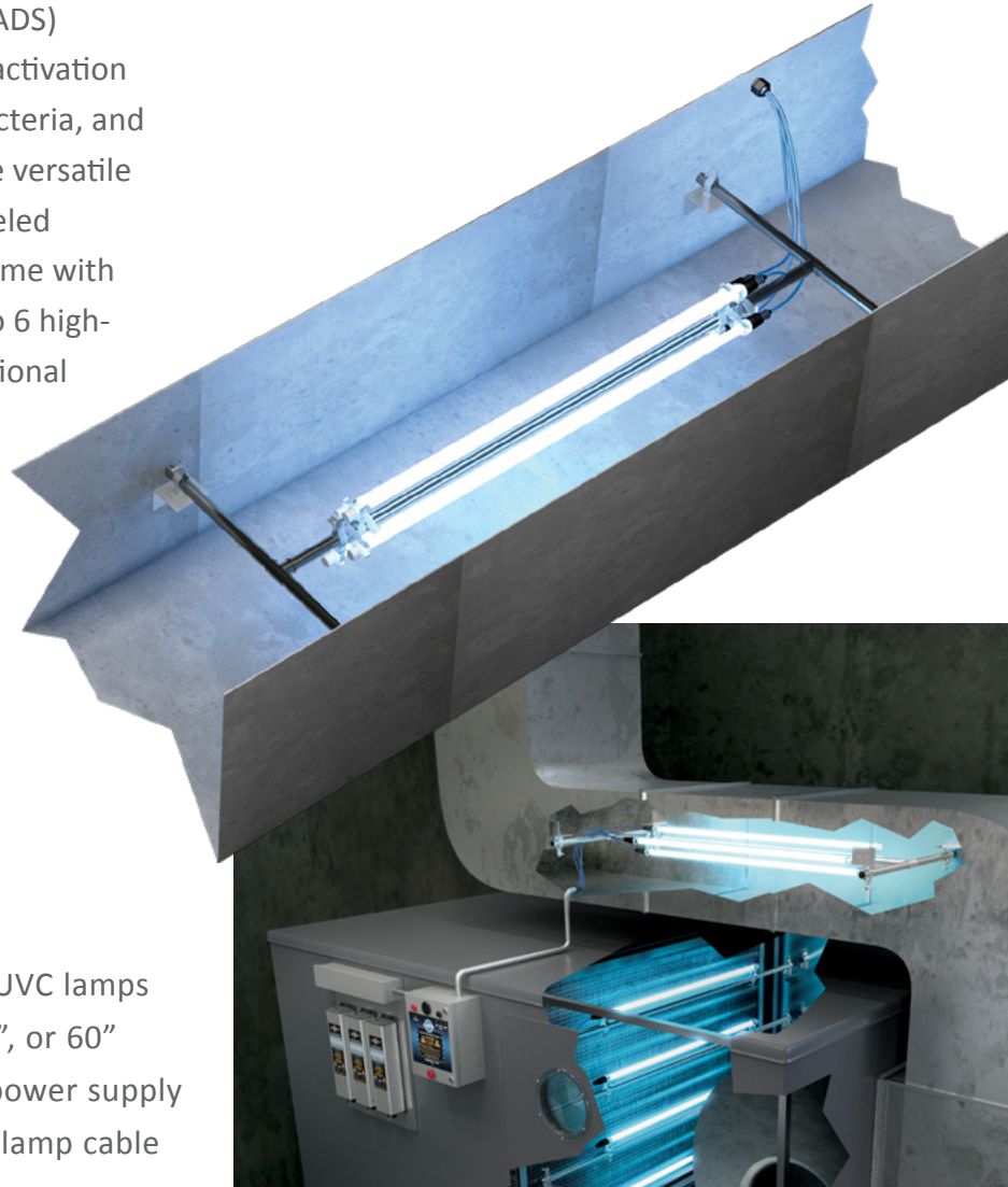
Airborne Duct System in commercial AHU with Tubular Rack System for coil disinfection