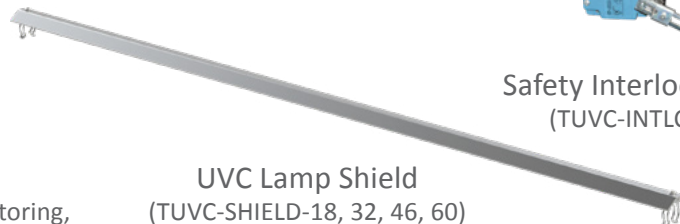
UVC Lamp Shield (TUVCL-SHIELD-18, 32, 46, 60)

With real-time LED lamp life monitoring, audible and visual alarms, and BMS integration (TUVCL-MNTR)