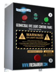
Control Box (TUVCL-CBX)